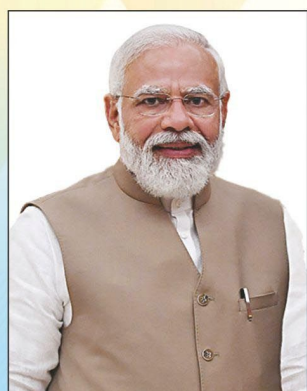
Shri Narendra Modi Hon'ble Prime Minister of India