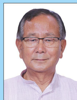
Shri Ranjan Singh Hon'ble Minister of State for Education