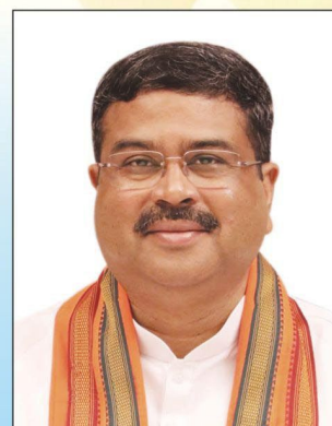
Shri Dharmendra Pradhan Hon'ble Education Minister