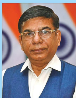
Dr. Subhas Sarkar Hon'ble Minister of State for Education