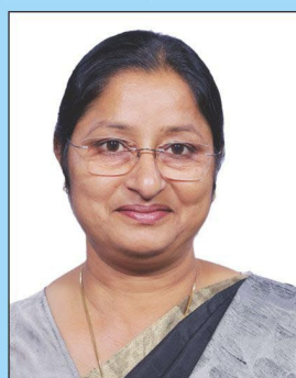
Mrs. Annpurna Devi Hon'ble Minister of State for Education