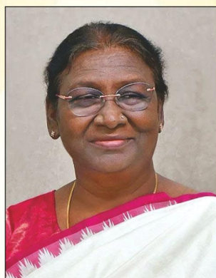
VISITOR Her Excellency Smt. Droupadi Murmu The President of India