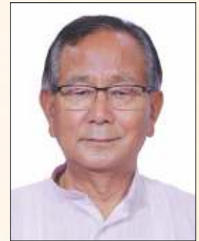
Shri Ranjan Singh Hon'ble Minister of State for Education