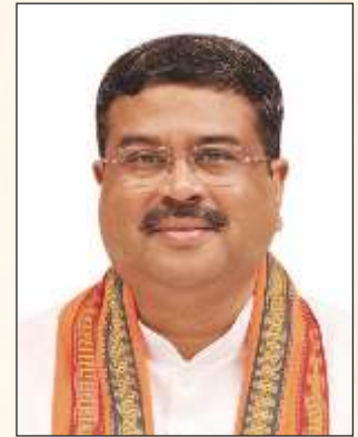
Shri Dharmendra Pradhan Hon'ble Education Minister