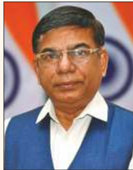
Dr. Subhas Sarkar Hon'ble Minister of State for Education