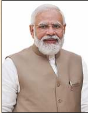
Shri Narendra Modi Hon'ble Prime Minister of India