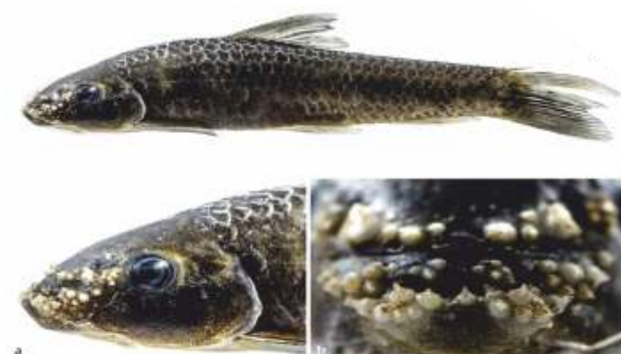
Figure: Gazza latishrami