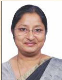
Mrs. Annpurna Devi Hon'ble Minister of State for Education