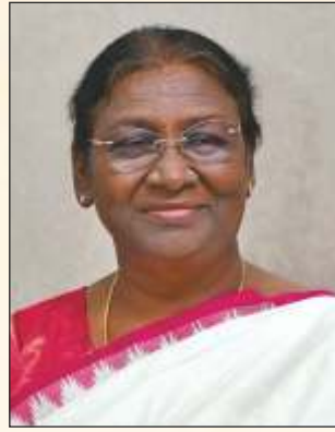
VISITOR Her Excellency Smt. Droupadi Murmu The President of India