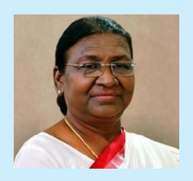
Visitor Her Excellency Smt. Droupadi Murmu The President of India

CENTRAL UNIVERSITY OF ODISHA Established by the Central Universities Act of Parliament (Act No.3C of 2009)