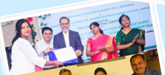
CUO PROJECT FELLOW RECEIVED POSTER AWARD- 2023