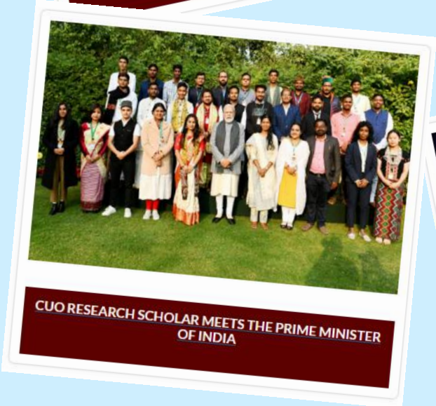
CUO RESEARCH SCHOLAR MEETS THE PRIME MINISTER OF INDIA