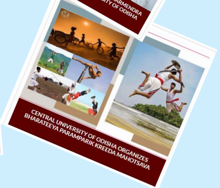
CENTRAL UNIVERSITY OF ODISHA ORGANIZES BHARATEEYA PARAMPARIK KREEDA MAHOTSAVA