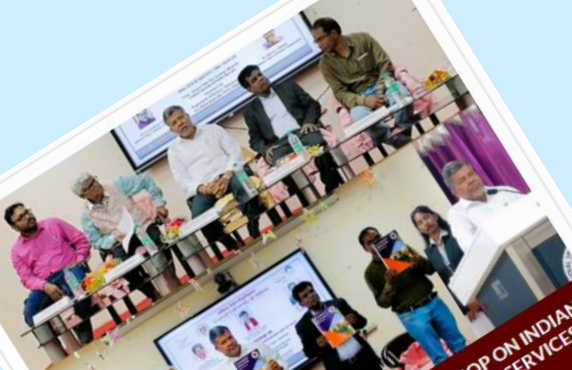
CUO ORGANIZES A TWO-DAY WORKSHOP ON INDIAN FINANCIAL MARKET: INSTRUMENTS AND SERVICES