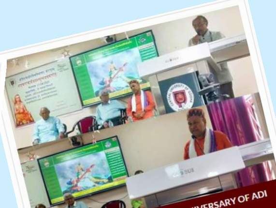
CUO CELEBRATES THE BIRTH ANNIVERSARY OF ADI GURU SHANKARACHARYA