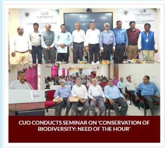
CUO CONDUCTS SEMINAR ON 'CONSERVATION OF BIODIVERSITY: NEED OF THE HOUR'