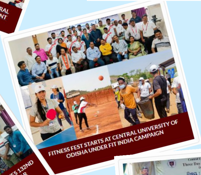
FITNESS FEST STARTS AT CENTRAL UNIVERSITY OF ODISHA UNDER FIT INDIA CAMPAIGN