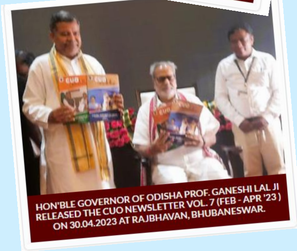
HON'BLE GOVERNOR OF ODISHA PROF. GANESHI LAL JI RELEASED THE CUO NEWSLETTER VOL. 7 (FEB - APR '23) ON 30.04.2023 AT RAJBHAVAN, BHUBANESWAR.