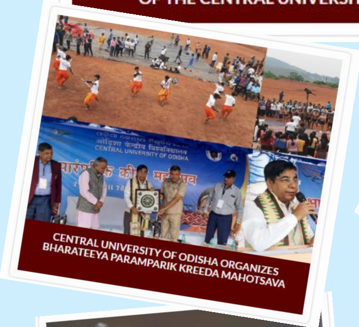
CENTRAL UNIVERSITY OF ODISHA ORGANIZES BHARATEEYA PARAMPARIK KREEDA MAHOTSAVA