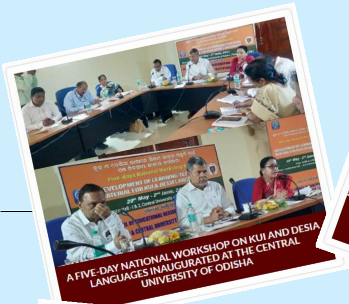
A FIVE-DAY NATIONAL WORKSHOP ON KUI AND DESIA LANGUAGES INAUGURATED AT THE CENTRAL UNIVERSITY OF ODISHA