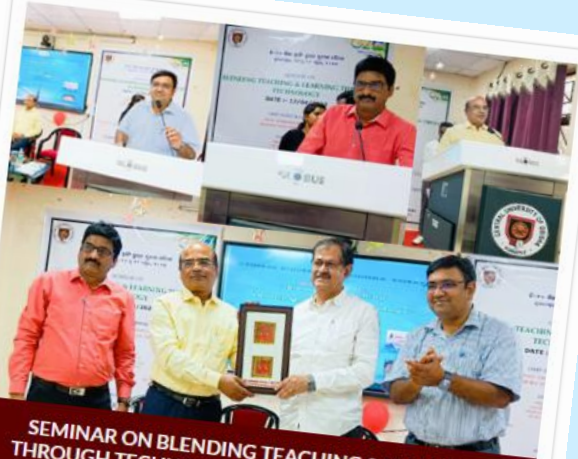
SEMINAR ON BLENDING TEACHING & LEARNING THROUGH TECHNOLOGY HELD AT CUO UNDER THE AEGIS G20 JAN BHAGIDARI