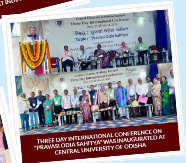
THREE DAY INTERNATIONAL CONFERENCE ON "PRAVASI ODIA SAHITYA" WAS INAUGURATED AT CENTRAL UNIVERSITY OF ODISHA