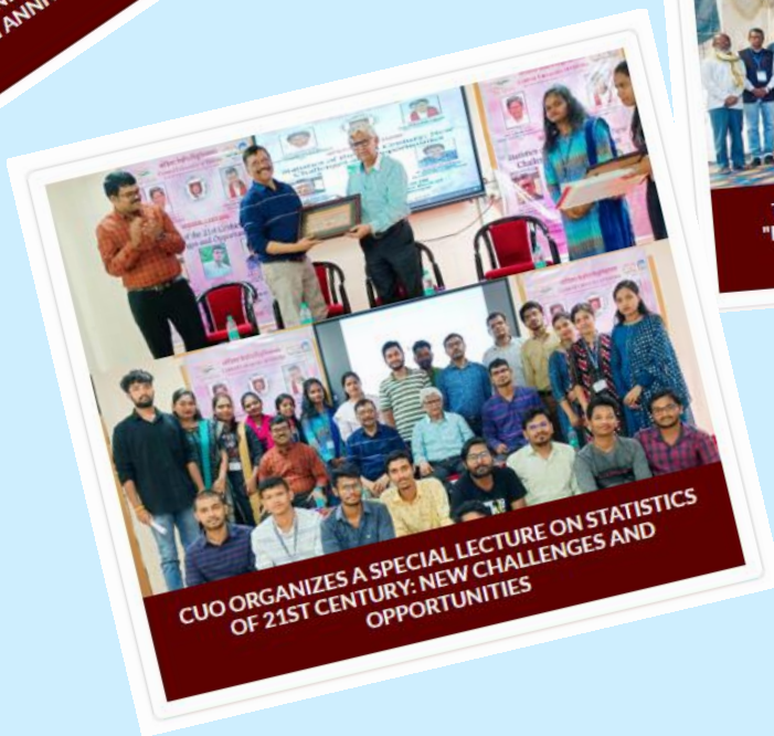
CUO ORGANIZES A SPECIAL LECTURE ON STATISTICS OF 21ST CENTURY: NEW CHALLENGES AND OPPORTUNITIES