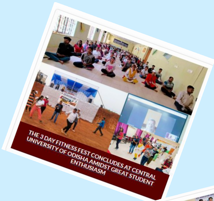
THE 3 DAY FITNESS FEST CONCLUDES AT CENTRAL UNIVERSITY OF ODISHA AMIDST GREAT STUDENT ENTHUSIASM