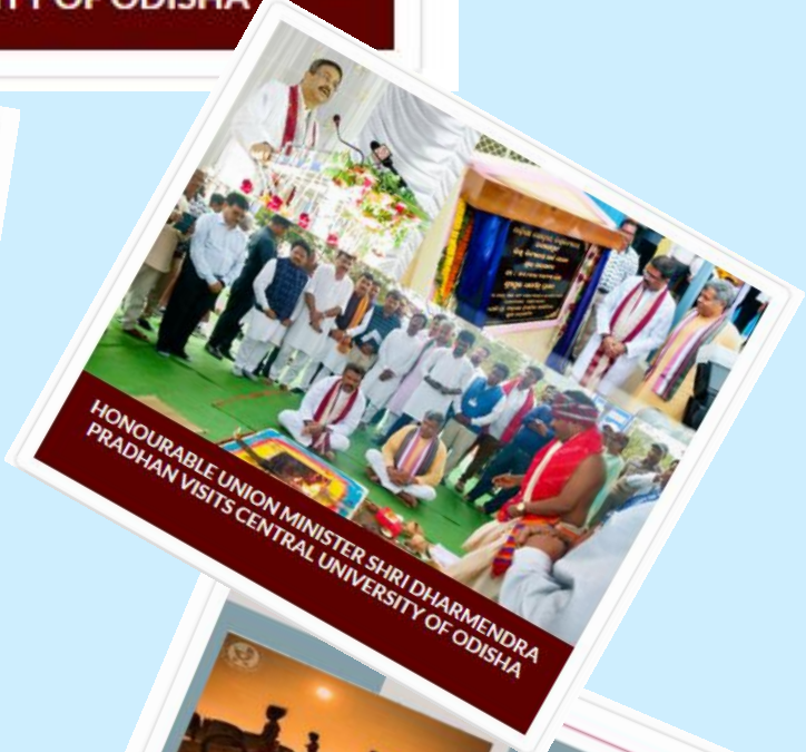
HONOURABLE UNION MINISTER SHRI DHARMENDRA PRADHAN VISITS CENTRAL UNIVERSITY OF ODISHA