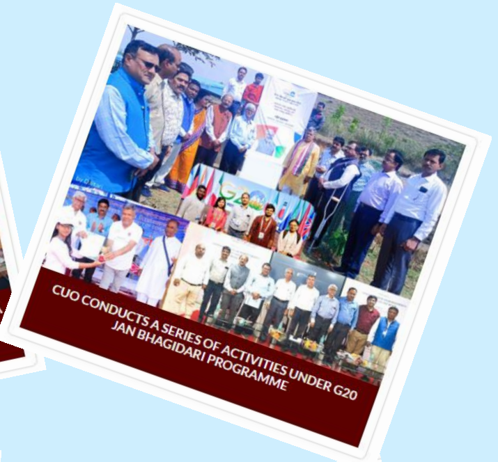
CUO CONDUCTS A SERIES OF ACTIVITIES UNDER G20 JAN BHAGIDARI PROGRAMME