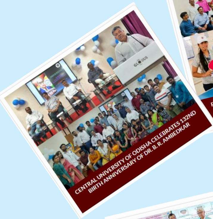
CENTRAL UNIVERSITY OF ODISHA CELEBRATES 132ND BIRTH ANNIVERSARY OF DR. B. R. AMBEDKAR