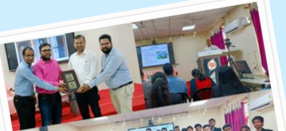
CUO ORGANIZES A SEMINAR ON 'MARKETING OF PRODUCTS OF INTEGRATED STEEL PLANT: STRATEGIES AND ESSENTIALITIES'