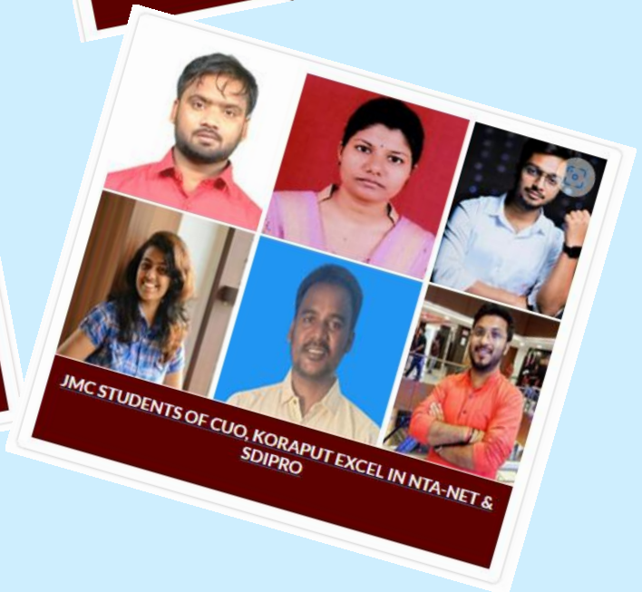
JMC STUDENTS OF CUO, KORAPUT EXCEL IN NTA-NET & SDIPRO