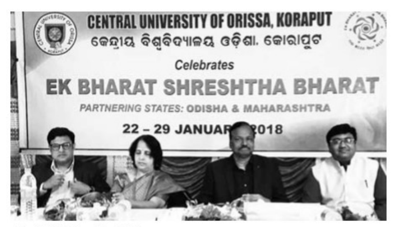
Central University of Orissa

Statesman News Service | Koraput | January 24, 2018 3:38 am