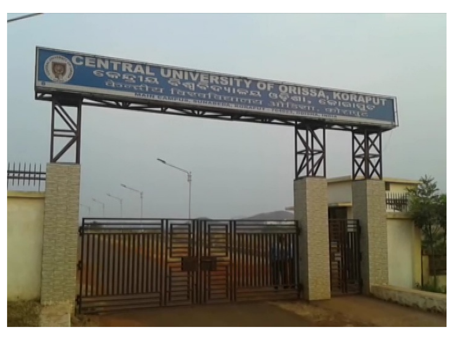
Share on Facebook