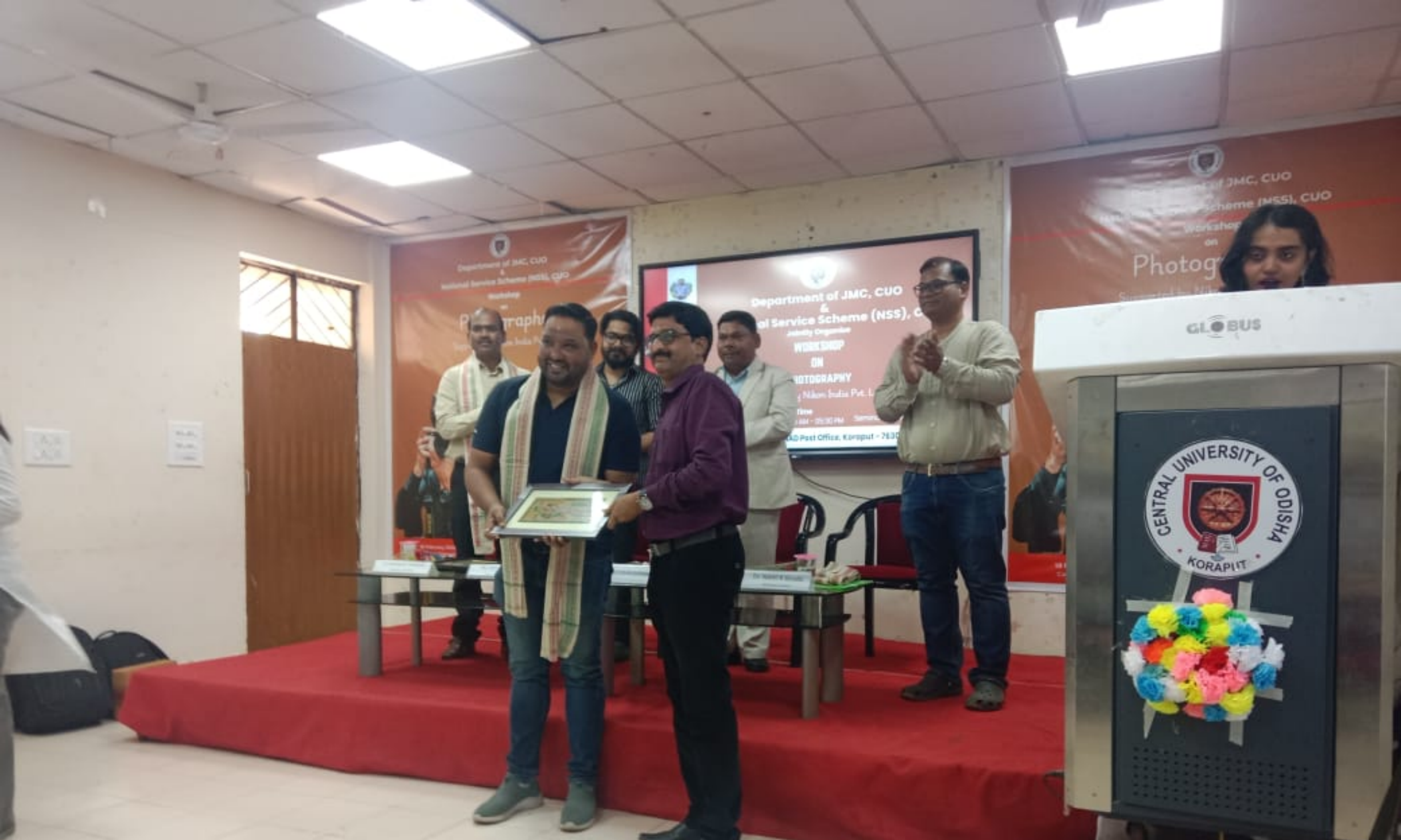
Glimpses of One Day workshop on Photography jointly organised by department of JMC and NSS of CUO and supported by Nikon India Pvt. Ltd. On 18 February, 2025