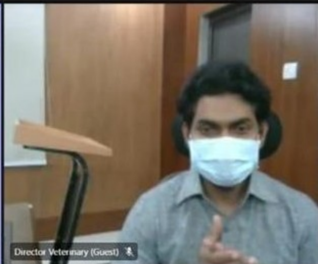
Director Veterinary (Guest)