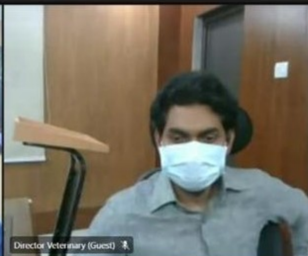
Director Veterinary (Guest)