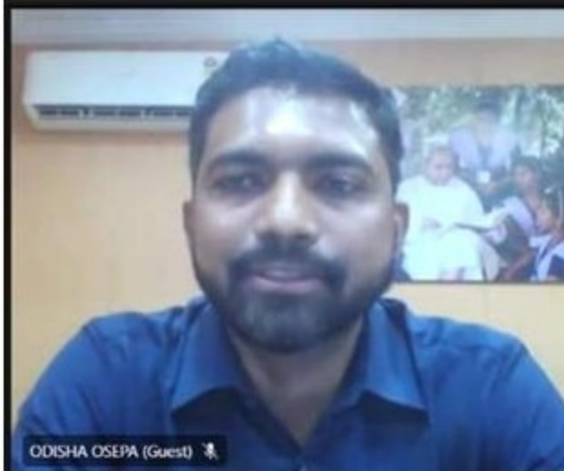
ODISHA OSEPA (Guest)