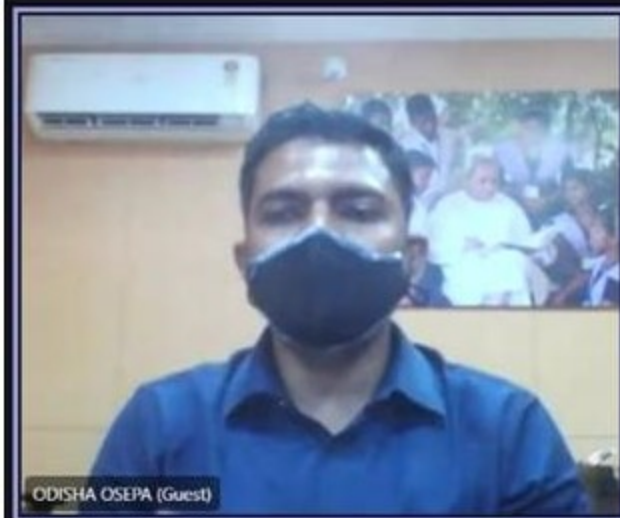
ODISHA OSEPA (Guest)