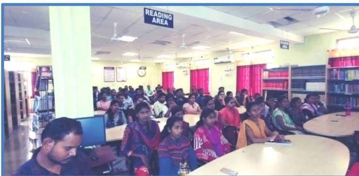
Library Orientation Programme - 2019

To provide maximum access to its resources, the Central Library remains open on all working days of the University from 09:00 hrs to 21:00 hrs. The Central Library at Sunabeda Campus is also kept open on Saturdays and Sundays from 10am to 1pm.