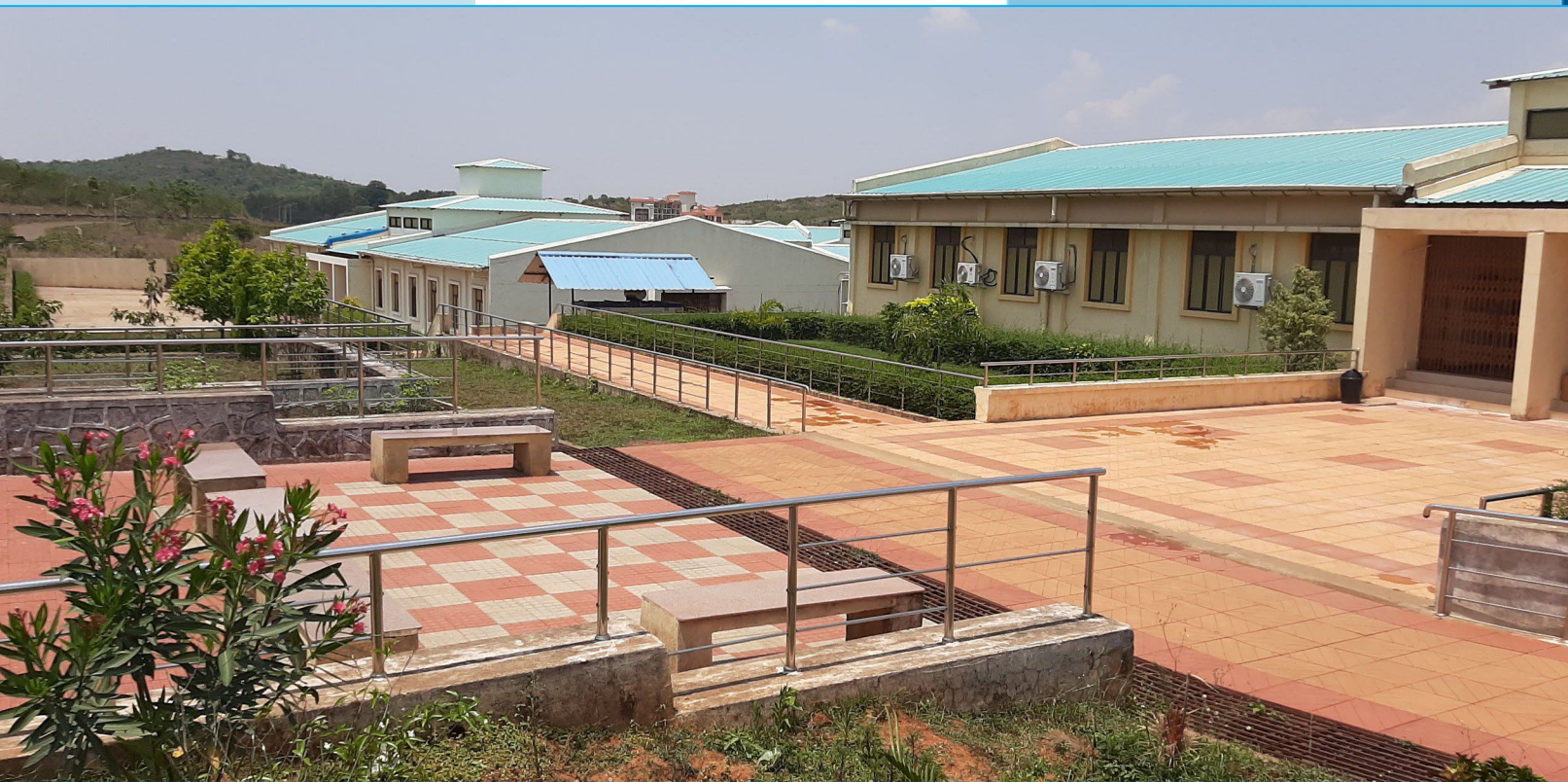
CUO campus at Sunabeda, Koraput