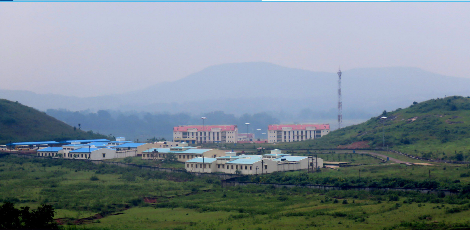
CUO campus at Sunabeda, Koraput