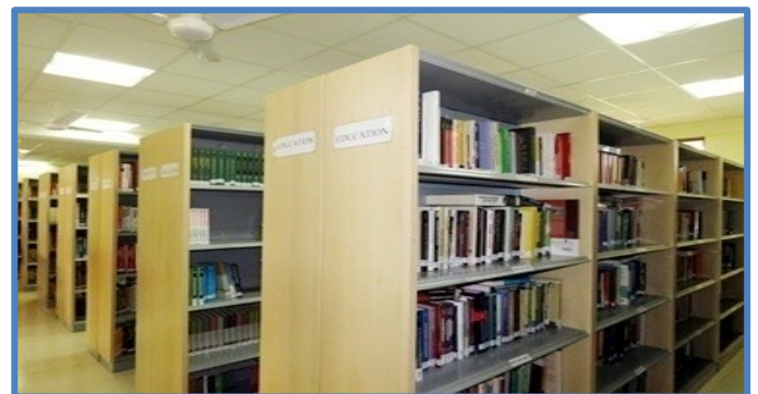
Central Library – Stack Area