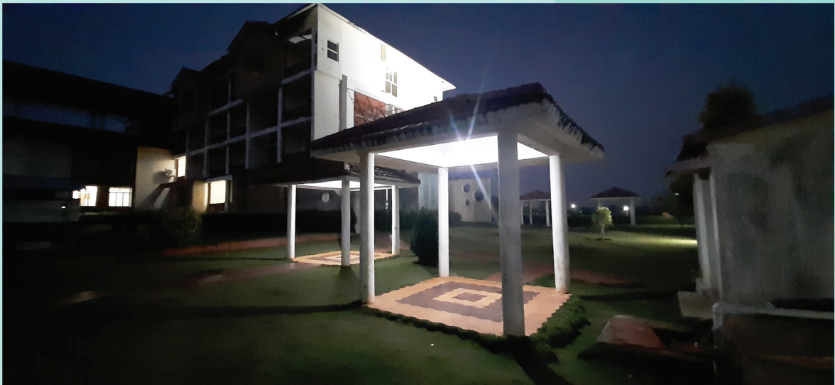
Night view of CUO Guest House at Sunabeda