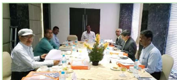
Meeting of 27th Executive Council

The 27 th meeting of the Executive Council was held on 10 February 2019