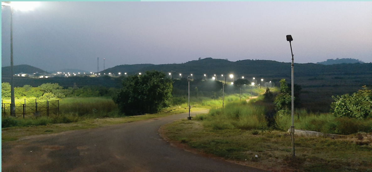
Evening view of CUO Campus at Sunabeda