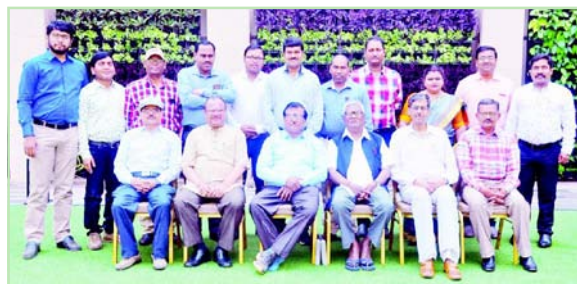
Members present at 17th Academic Council

The 25 th meeting of Building Committee was held on 04 June 2018