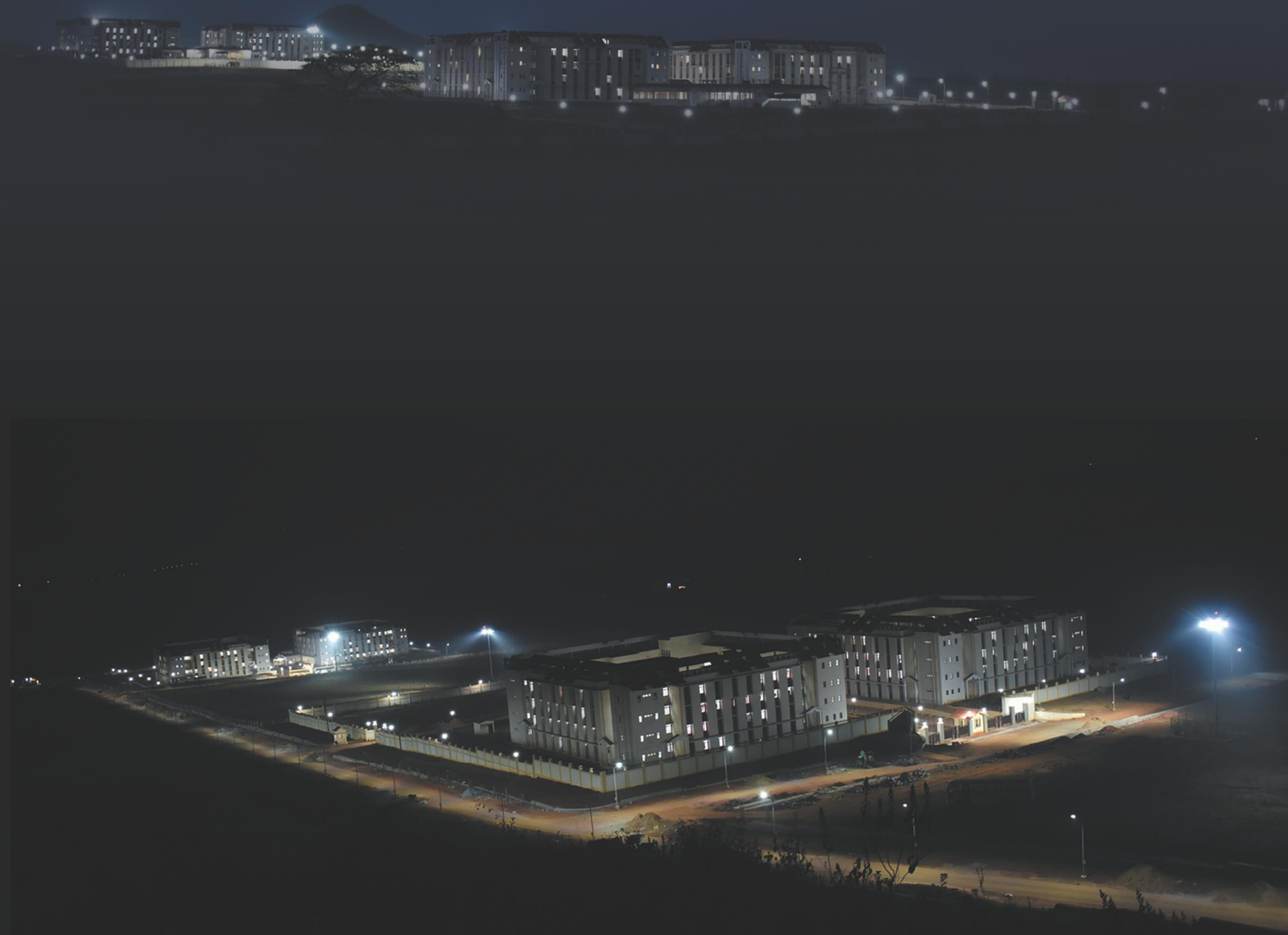
The night view of the CUO Main Campus at Sunabeda