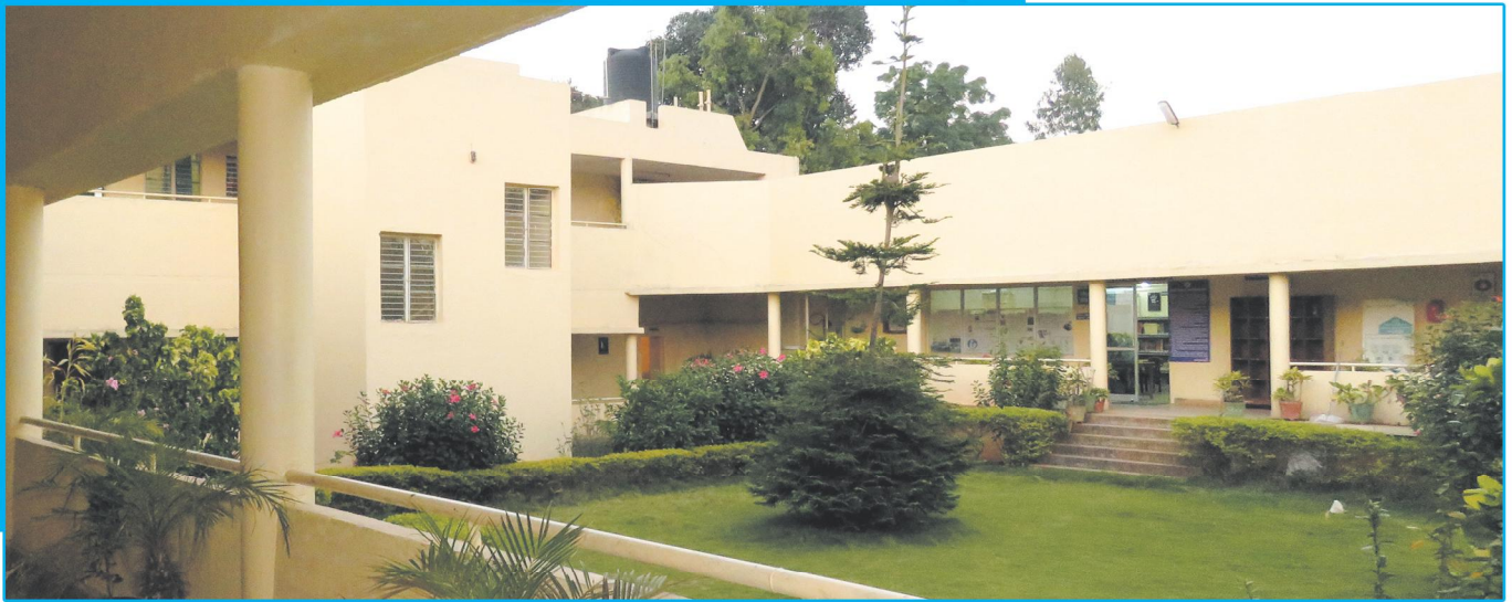
CUO City Center inside