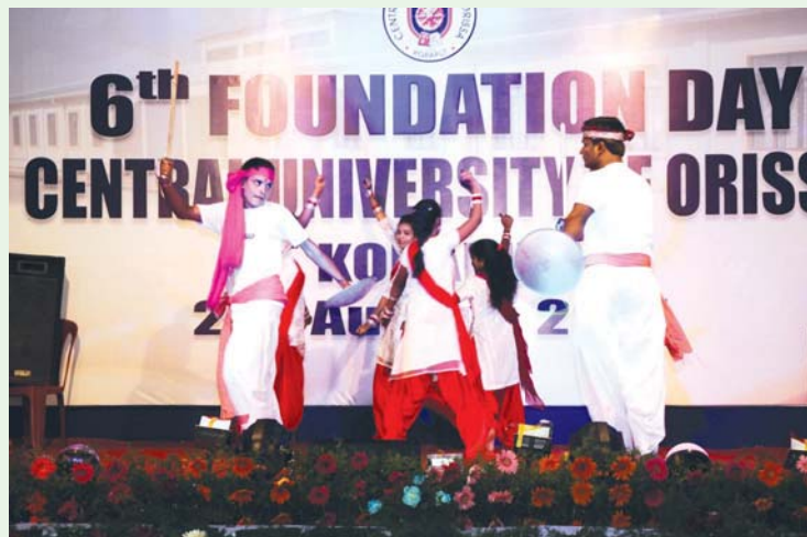
Students of CUO performing Paika Dance