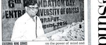
Koraput, 29 August

The Central University of Orissa (CUO) organised several programmes to mark its sixth foundation day at Landiguda campus here today.