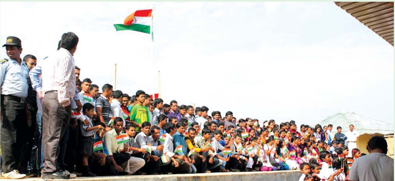
Staff and students of CUO during the 68th Independence Day celebration at the University Campus, Landiguda, Koraput