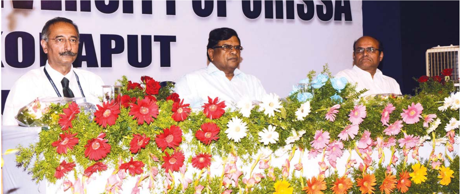
Sitting on the dais: