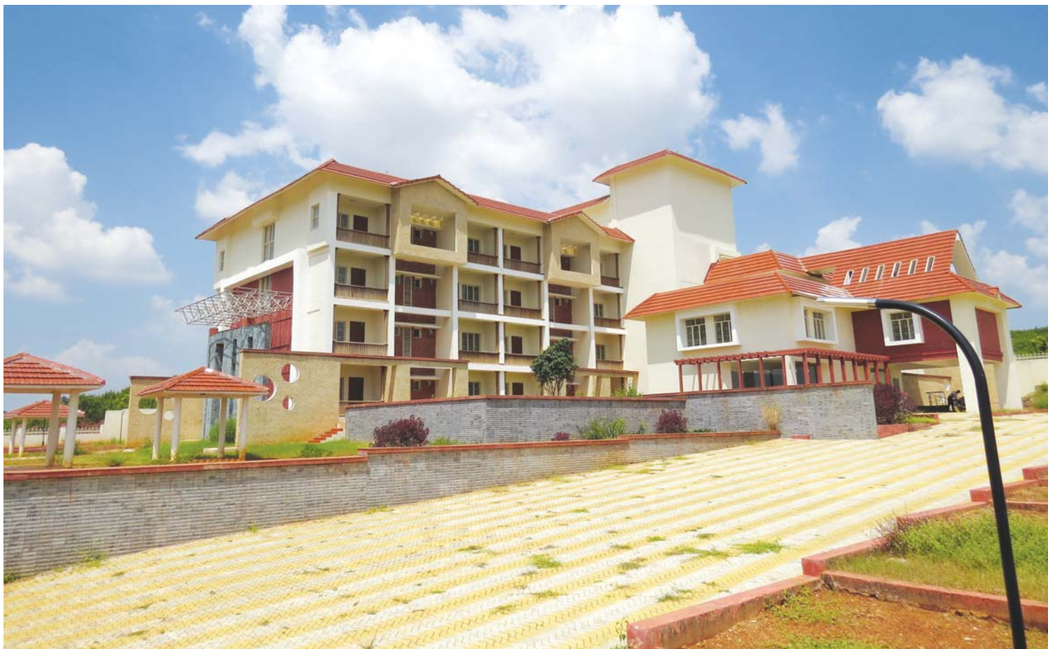
Guest House at the permanent Campus of CUO, Sunabeda