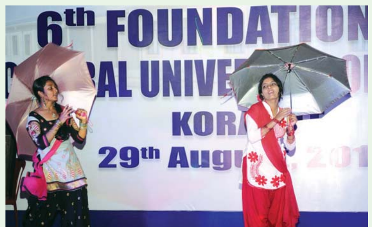
Students of CUO performing Modern Dance