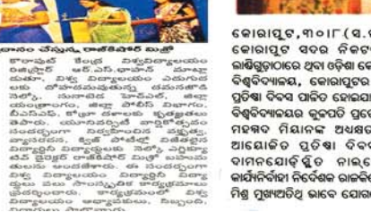
6th FOUNDATION DAY CENTRAL UNIVERSITY OF ORISSA KORAPUT