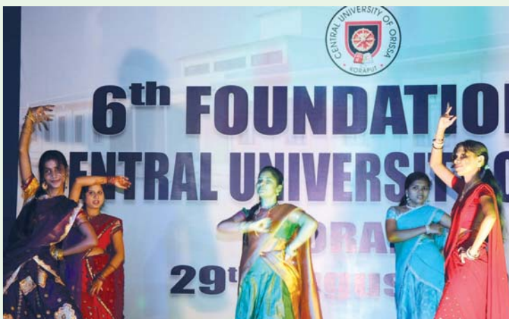
Students of CUO performing Modern Dance