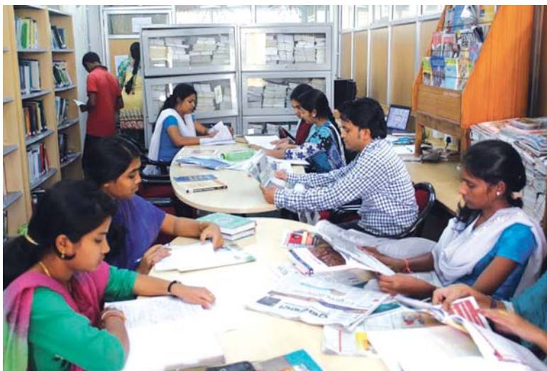
Mind at work in the Central Library of CUO