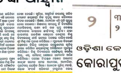
6th FOUNDATION DAY CENTRAL UNIVERSITY OF ORISSA KORAPUT