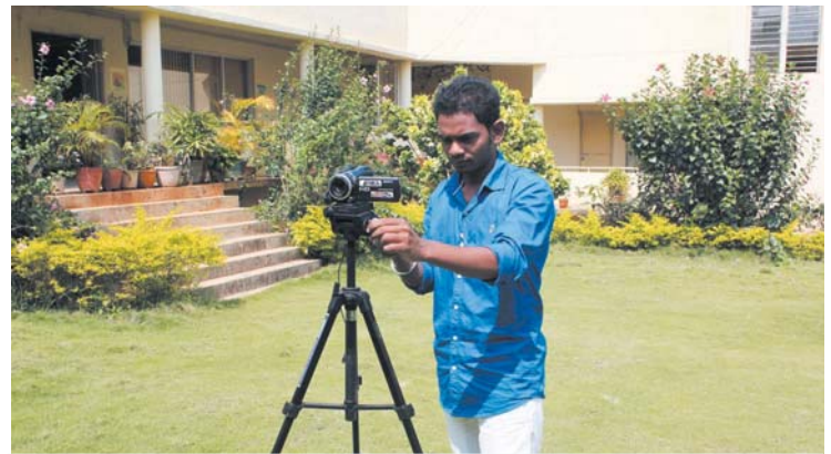
A student of J & MC taking shots at the University Campus, Koraput