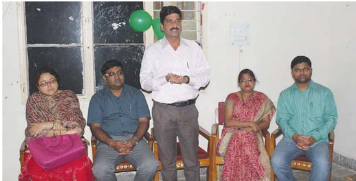
Teachers' Day was celebrated in the department on 5 th September, 2014.