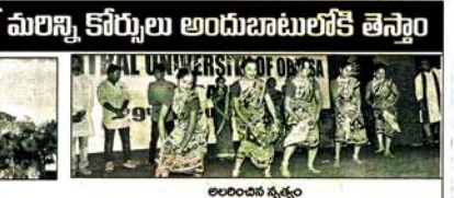
ପ୍ରତିଷ୍ଠାଦିନ ପାଳନରେ ଶିକ୍ଷା ଉପରେ ଗୁରୁତ୍ୱ