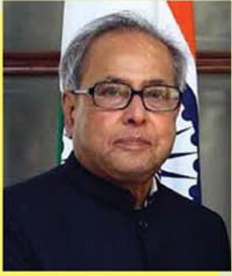
His Excellency, Shri Pranab Mukherjee, Hon'ble President of India & the Visitor, Central University of Orissa