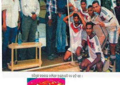
6th FOUNDATION DAY CENTRAL UNIVERSITY OF ORISSA KORAPUT