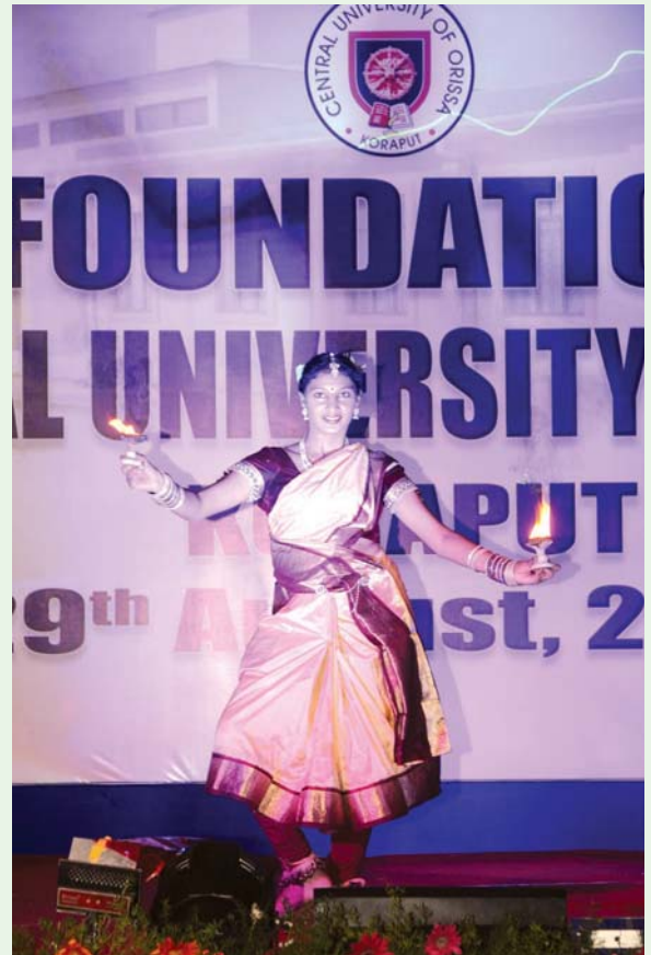
A Student of CUO performing Classical Dance