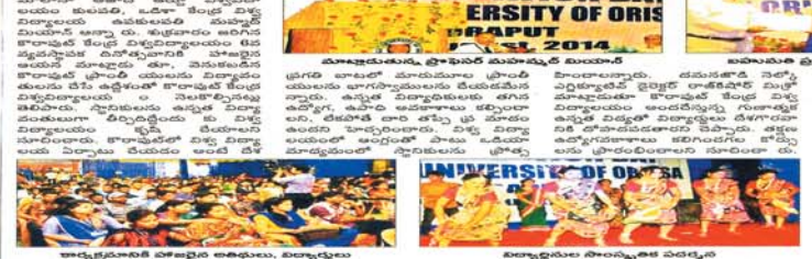
6th FOUNDATION DAY CENTRAL UNIVERSITY OF ORISSA KORAPUT