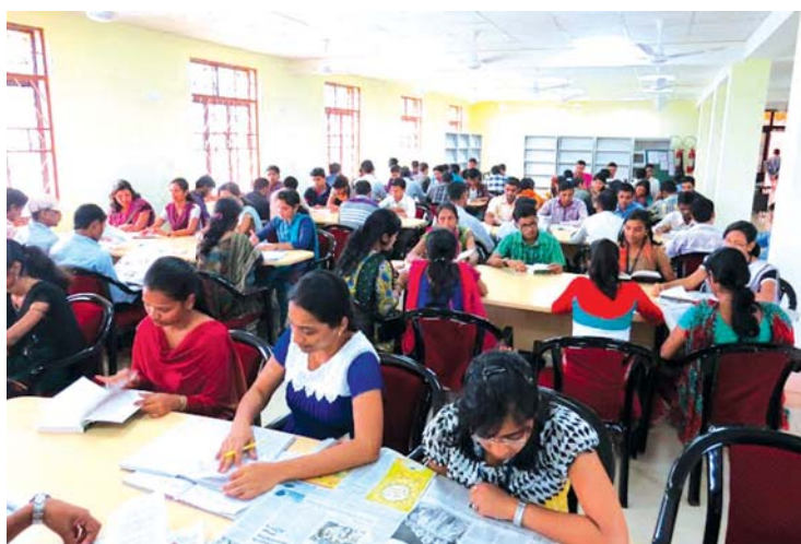
Mind at work in the Central Library of CUO at permanent Campus, CUO

Central Library has access to the following e-resources and which can be accessed in the Landiguda campus of CUO.