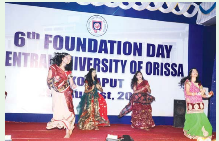
Students of CUO performing Rajastani Dance