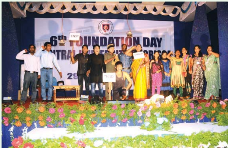
Students of CUO performing Social Drama