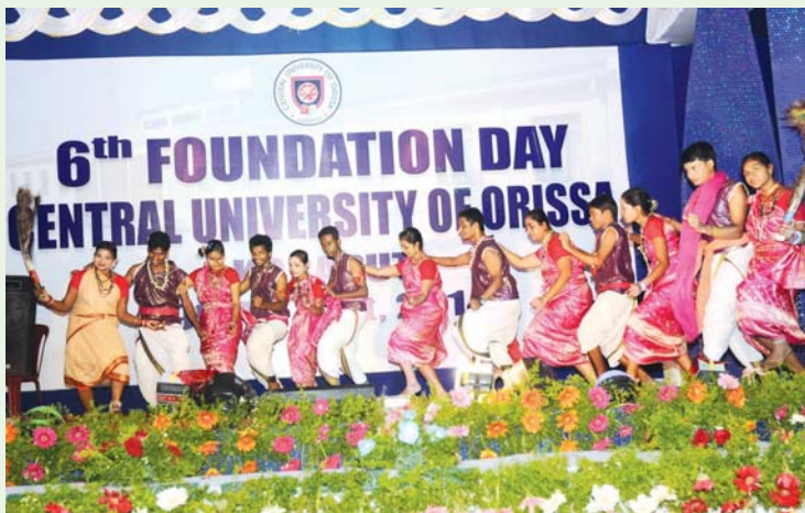
Students of CUO performing Dhemsa