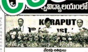
କେନ୍ଦ୍ରୀୟ ବିଶ୍ୱବିଦ୍ୟାଳୟର ୬ଷ୍ଠ ପ୍ରତିଷ୍ଠା ଦିବସ