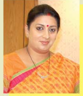
Smt. Smriti Zubin Irani, Hon'ble Union Minister of Human Resource Development, Govt. of India