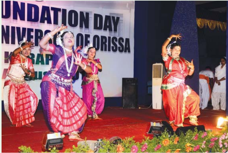
Students of CUO performing Odissi Dance