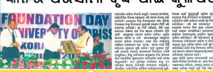
6th FOUNDATION DAY CENTRAL UNIVERSITY OF ORISSA KORAPUT