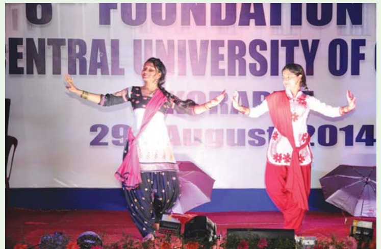
Students of CUO performing Modern Dance