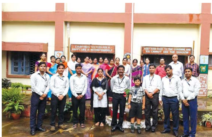
Trainee Teachers of Centre for Teacher Education during Internship Programme in School

Internship programme of the trainee teachers of B.Ed. Course for the session 2013-14 was organised in different schools of Koraput locality in the month of June, July and August. Trainee teachers of B.Ed. programme have undergone internship programme for a period of 40 days in the practising schools named Govt. High School, Semiliguda; Aeronautic Girls High School, Sunabeda-II; Govt. High School, Nighamaniguda; Jagganath Vidyapith, Sunabeda; Public School, Sunabeda; VS Vidyalaya, Sunabeda; Netaji English Medium School, Semiliguda; Jeevan Jyoti Public School, Semiliguda; Govt. High School, Koraput; Deomali Public School, Semiliguda.