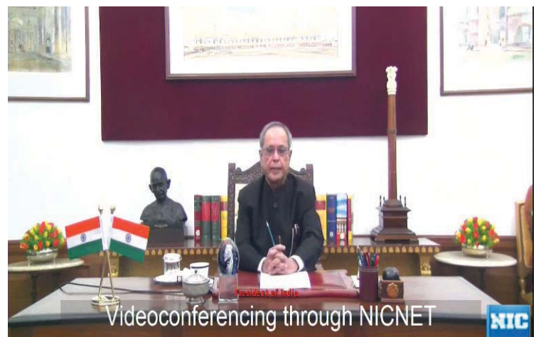
His Excellency, Shri Pranab Mukherjee, Hon'ble President of India addressing to the Higher Educational and Research Institutions on the topic, "Democracy And Governance"

3. This Election has provided majority to a single party for the formation of a stable government after thirty years, with a mandate to provide good governance. Good governance is a mechanism to establish order, pursue social and economic progress and promote welfare of the people. As developing countries grapple with a multitude of socio-economic objectives, standards of governance have come into sharp focus in recent years. In this backdrop, I have chosen to speak to you today on an issue of contemporary relevance - Democracy and Governance.