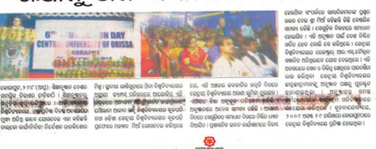
6th FOUNDATION DAY CENTRAL UNIVERSITY OF ORISSA KORAPUT