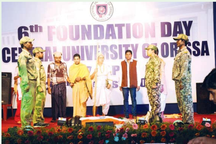
Students of CUO performing Patriotic Drama