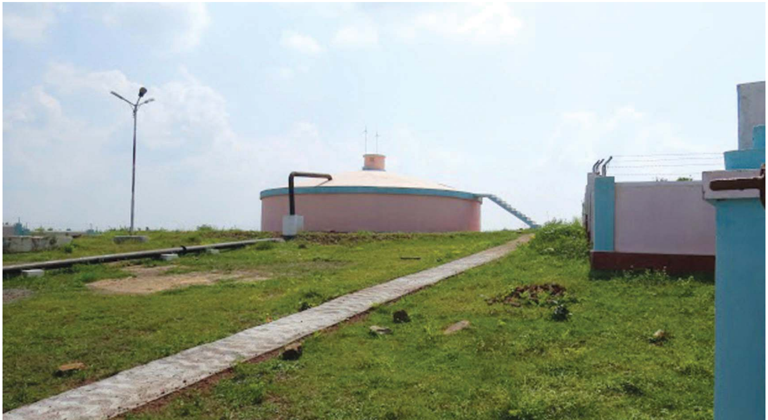
Overhead water tank at the permanent Campus of CUO, Sunabeda