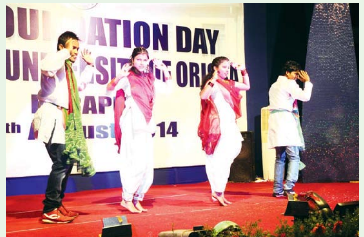
Students of CUO performing Patriotic Dance