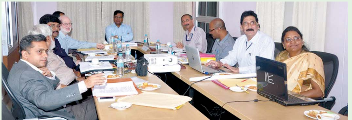
Members present at 21st Building Committee Meeting, held on 10th November, 2014

20 th Building Committee Meeting was held on 26 th May, 2014 21 st Building Committee Meeting was held on 10 th Nov., 2014