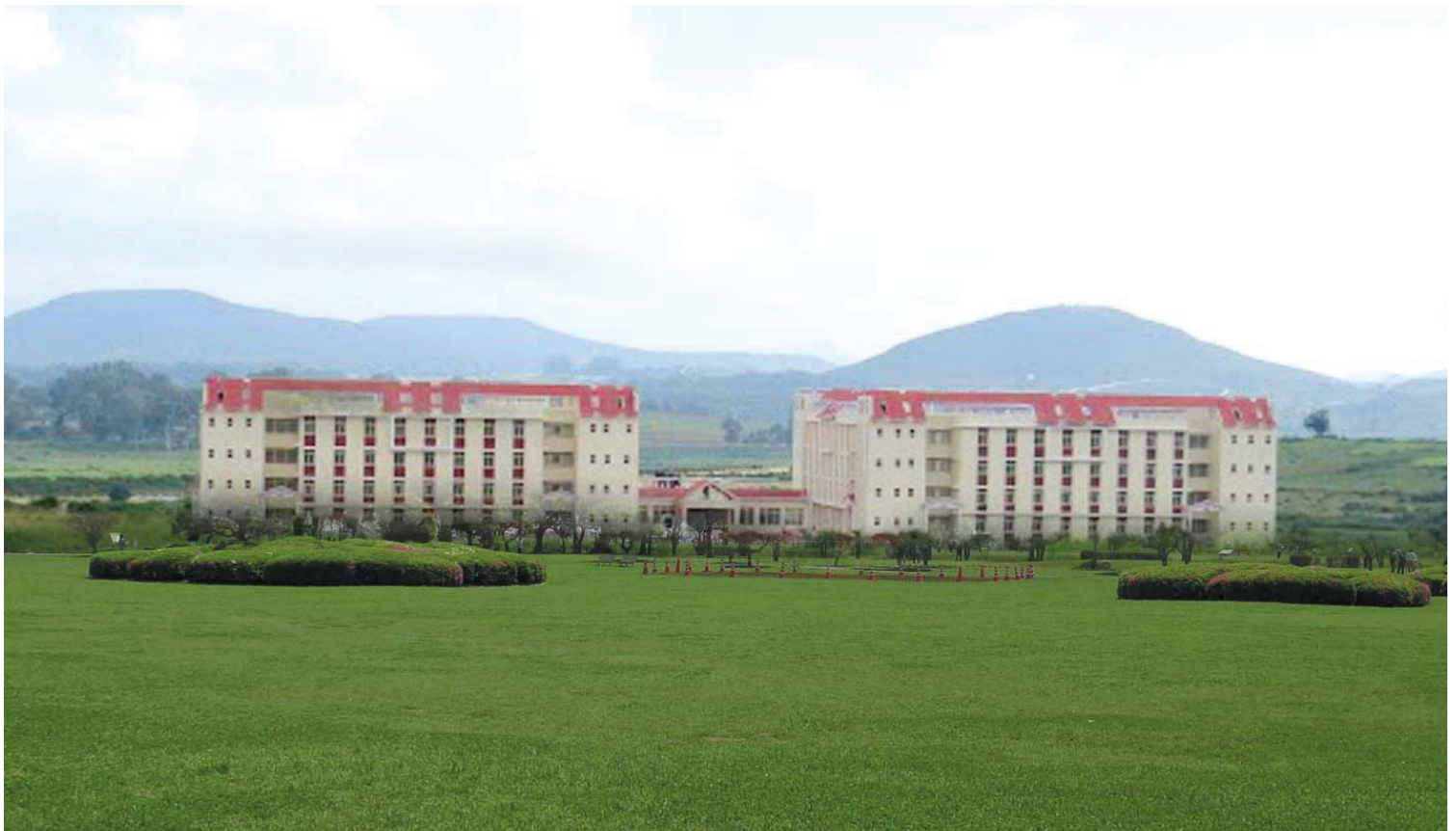
Birds' Eye view of Boys' Hostel at the permanent Campus of CUO, Sunabeda