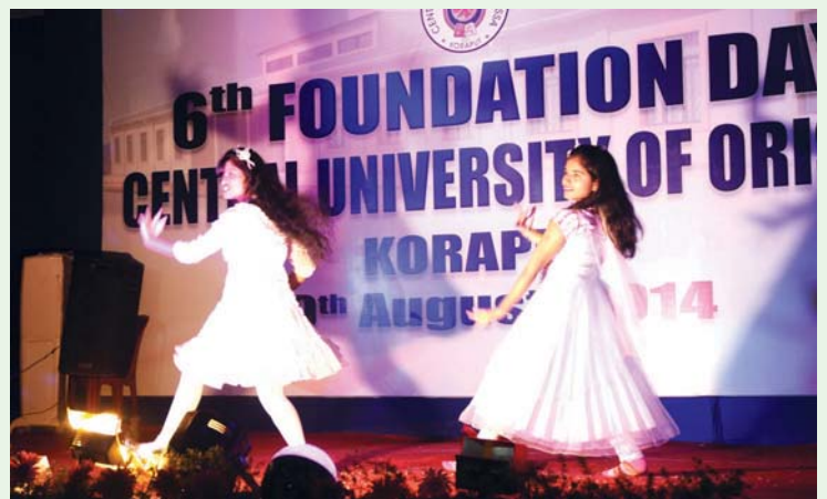
Students of CUO performing Modern Dance