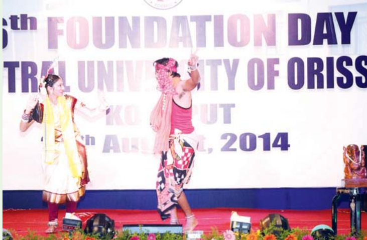
Students of CUO performing Sambalpuri folkDance