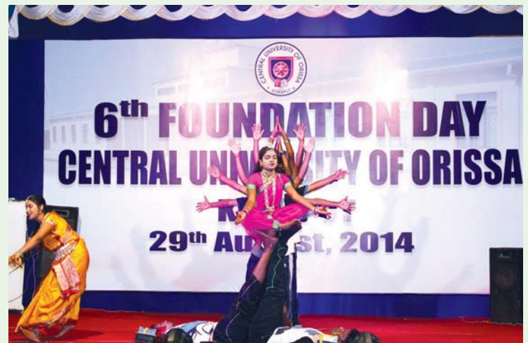
Students of CUO performing Acrobatic Dance