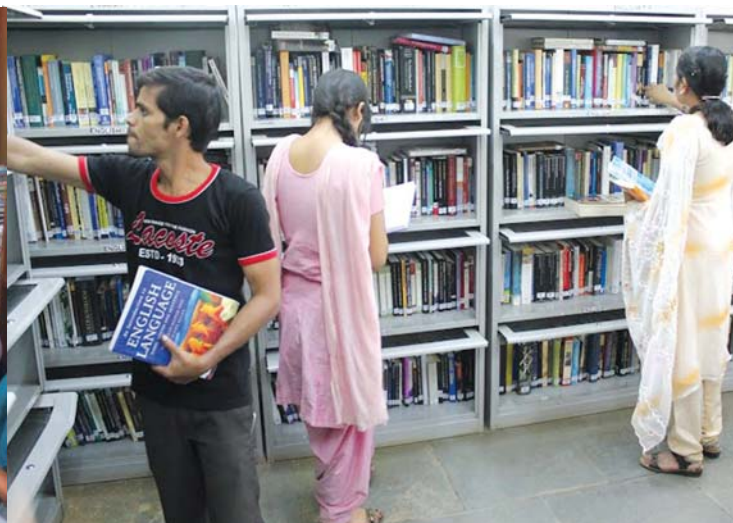
Students collecting the books in the Central Library of CUO

Central Library of CUO is one of the important central facilities of the University catering to the information needs of faculty, research scholars and students in Arts, Humanities, Social Sciences, and Sciences. It is set up as an integral part of university system to cope with its multidimensional activities. At present University library is subscribing to 82 print journals (both national and international) and more than 8000 electronic journals are accessed online through UGC Infonet Digital Library consortium. In the last year a major work was taken to automate its central library by the use of integrated library management software KOHA. It is an open source software and is extensively used in major libraries all across the globe. Central library has latest photo copying machines for providing reprographic services to its library users at our main campus at Sunabeda.