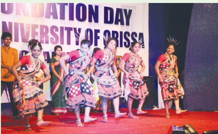
Students of CUO performing Sambalpuri Dance