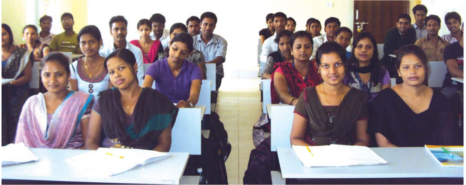
Students of Centre for Sociological Studies in the class room at the permanent campus of CUO, Sunabeda

Classes at Main campus of Central University of Orissa at Sunabeda started on 20th October, 2013 with shifting of the Centre for Teacher Education (B.Ed. Programme) there. As first batch of 100 students took admission in B.Ed. Programme, it was decided to start the Course from the Main campus. The B.Ed. classes are running with 06 members of the Faculty and 100 students. Subsequently, the Centre of Sociological Studies (CSS) shifted to the main campus and classes started from 20 th December, 2013. Three members of the faculty with 80 P.G.