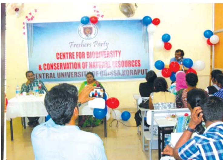
Members of the faculty with students in the Freshers' Party: 2014-15