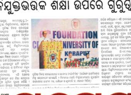
6th FOUNDATION DAY CENTRAL UNIVERSITY OF ORISSA KORAPUT