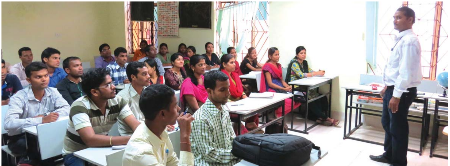
Students of Centre for Teacher Education in the class room at the permanent campus of CUO, Sunabeda

On 7 th July, 2014 other two centres i.e. Centre for Mathematics & Centre for Economics were shifted to the main campus. The classes of Mathematics are running with two faculty members and 84 students. Similarly the classes of Economics are running with three faculty members and 61 students. Presently total students' strength at the main campus is 350.