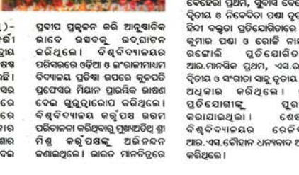
6th FOUNDATION DAY CENTRAL UNIVERSITY OF ORISSA KORAPUT