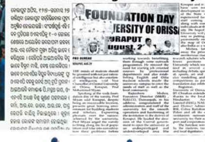
STATESMAN NEWS SERVICE Koraput, 29 August