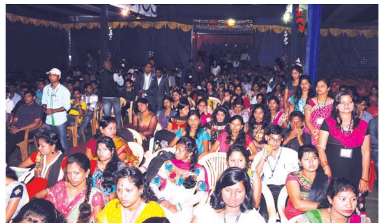
Students of the CUO at the 6 th Foundation Day Programme of CUO.