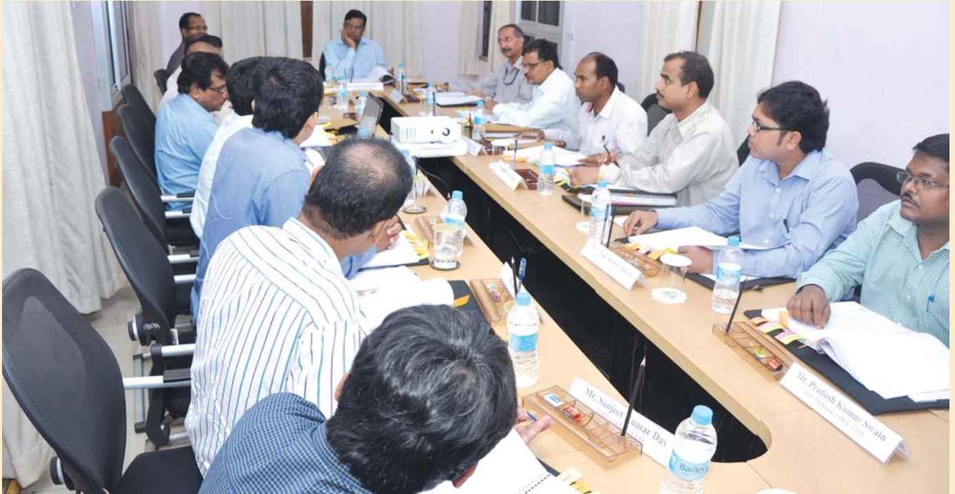
Members present at 13th Academic Council Meeting, held on 10th November, 2014

13 th Academic Council Meeting was held on 10 th November, 2014