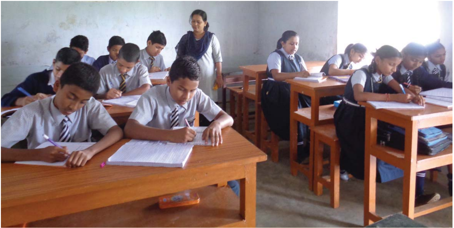
Trainee Teachers of Centre for Teacher Education during Internship Programme in School