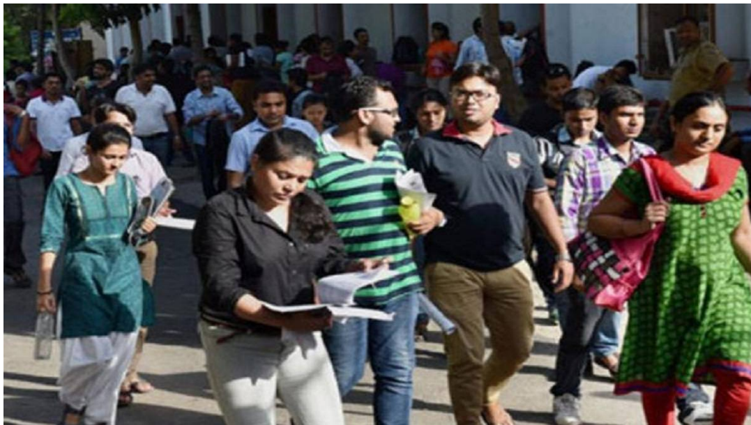
Central University of Odisha sets up center to impart digital literacy to tribal students

The unit will be made operational at the Centre for Tribal Welfare and Community Development (CTWCD) of the Central University of Odisha at Koraput to train the youth belonging to ST, SC, OBC, and other marginalised communities of the district on digital skills.