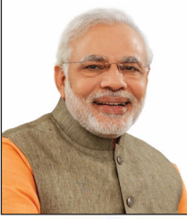
Shri Narendra Modi